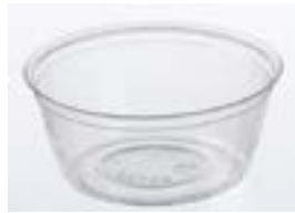
510173 POLAR DISH DESERT CLEAR 6OZ 20/50EA