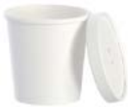
510611 SOLO CONT WHITE 16OZ PAPER W LID 250/1CA