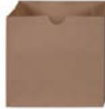
504574 DELUXE BAG SNACK SACK 4X1.75X3.13" 1/1000PC