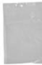
504292 ALPHA BAG POLY SELF CLOSE 10 X12 1/1000EA