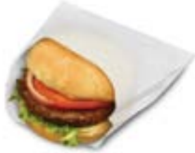
504444 DELUXE WHITE DRY WAX SANDWICH BAG 1/1000EA