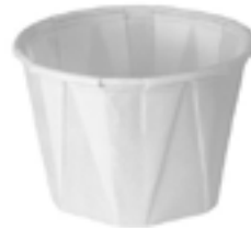
510696 SOLO CUP PORTION 1OZ PAPER 20/250EA