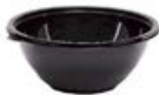
510870 POLAR BOWL SALAD 12" BLACK 1600Z PET 1/25CA