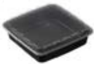
510587 POLAR CONT/LID 48OZ BLACK MICRO 1/100CA