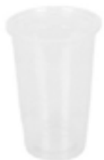
519150 POLAR CUP 14OZ CLARUS PLASTIC POLY 20/50EA