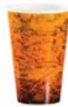
513067 DART CUP 200Z FOAM FUSION ESCAPE 25/20EA