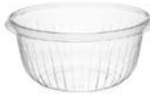
510451 DART BOWL SALAD CLEAR 16 OZ 1/500EA