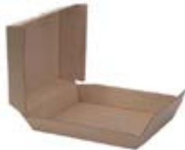
507237 DELUXE CONT TO GO ECO 8X8X3.6 1/110PC