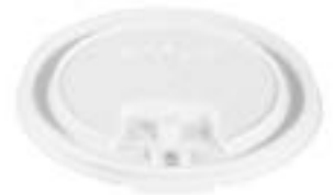
516519 SOLO LID LOCK BACK WH 10OZ SQ/20OZ 10/100EA