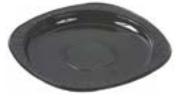
543122 POLAR PLATE 9" BLACK PLASTIC 4/125EA