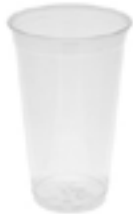
305290 PCA CUP PLASTC COLD 240Z CLEAR PET 600/1PC