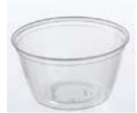
510169 POLAR DISH FOOD PLASTIC 8OZ 20/50EA