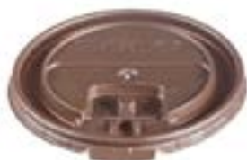
516932 SOLO LID BROWN FLIP BACK FOR 10-24 1/2000EA