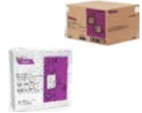
540116 CASCAD NAPKIN DINNER 1/8 1PLY WHITE 12/250EA