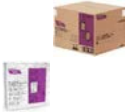
540126 CASCAD NAPKIN DINNER 1/8 2PLY WHITE 20/150EA