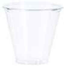
519284 CONEX CUP 50Z CONEX CLASSIC CLEAR 25/100EA