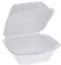
510307 PACTIV CONTAINER FOAM 5.75X5.75X3.25 4/125EA