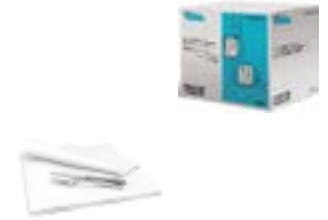
540122 CASCAD NAPKIN FLAT 15X15 AIRLAID 1/1000CA