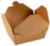
510619 HYPAX CONTAINER ECO #8 KRAFT 6.75 X 5.5 X 2.5 - 300/1EA