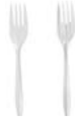
531115 HYSTIX FORK MEDIUM WHITE POLYPRO 1/1000EA