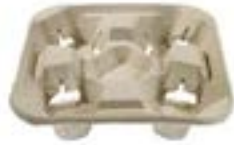
510777 CKF TRAY 4 CUP CARRIER 8.6X8.5X1.9 1/300EA