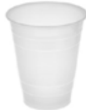
305313 PCA CUP COLD PLASTIC 16 OZ TRANSL 960/1PC