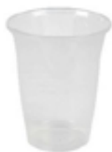
519111 POLAR CUP 9OZ PLASTIC ALPHA/ CLARUS 50/50EA