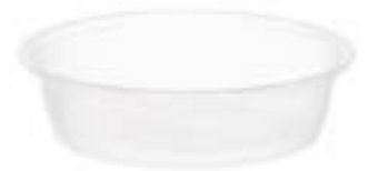
511001 STONE CUP PORTION 1.5OZ PLASTIC CLR 10/250EA