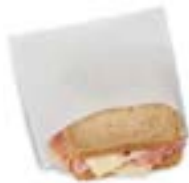
504663 DELUXE BAG SANDWICH WHITE REGULAR 1/1000EA