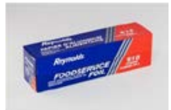
558141 PACTIV ROLL FOIL COUNTER 30CM HEAVY 1/200MR