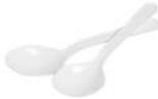
531162 POLAR SOUP SPOON ECOPRO DEGRADABLE 1/1000EA