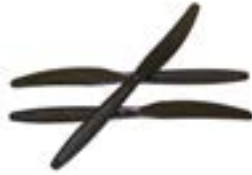
531014 511 KNIFE BLACK HEAVY DUTY 1/1000EA