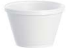
510224 DART CONTAINER FOAM SQUAT 10OZ 20/50EA