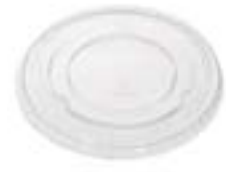
510689 STONE LID FOR 3.25 - 5.5 OZ PORTION 25/100EA