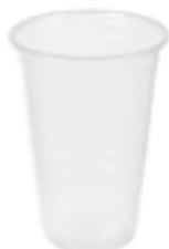
519153 POLAR CUP 16OZ CLARUS PLASTIC POLY 20/50EA