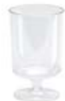
519109 POLAR CUP WINE PLASTIC 5.5 OZ 50/10EA