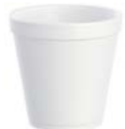
510296 DART CONTAINER FOAM 16OZ 20/25EA