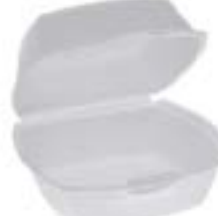
510309 PACTIV CONTAINER SANDWICH FOAM 5" 4/125EA