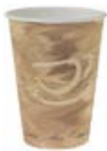
516583 SOLO CUP 16OZ HOT PAPER MISTIQUE 20/50EA