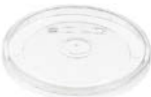
511403 SOLO LID 6/8/10 OZ CLEAR VENTED 10/100EA