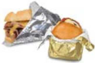
558354 DELUXE WRAP THERMO FOIL 12X12 LIGHT 1/1000EA