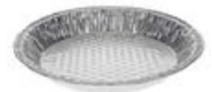
510925 PACTIV PLATE PIE 9" DEEP FOIL 1/500CA