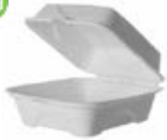
511075 POLAR CONT MEAL HINGED 6" BAGASSE 10/50EA