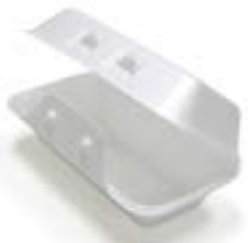
510351 PACTIV CONT FOAM 1 COMP 8.75X5X3 HING 2/110EA