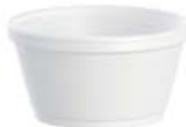
510222 DART CONTAINER FOAM EXTRA SQUAT 8OZ 20/50EA