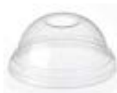
519177 POLAR LID 1.5" DOME STRAW HOLE 10/100EA