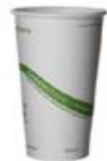
516665 POLAR CUP HOT DRINK PLA 160Z 20/50EA