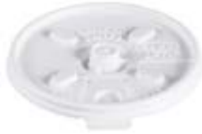
513202 DART LID LIFT 'N LOCK WHITE FOR 8J8 1/1000EA