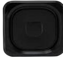
511318 POLAR TRAY SQUARE BLK 10.7" CONTOUR 1/25EA