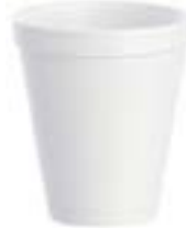
513207 DART CUP 100Z PLAIN FOAM 40/25EA