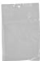
504268 ALPHA BAG POLY SELF CLOSE 4X6 1/1000EA