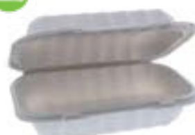
304678 PACTIV CONT EARTH- CHOICE 9X6 MICRO 270/1PC