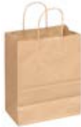
504463 DELUXE BAG KRFT PAPER HANDLE 8X4.5X10 1/250EA