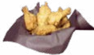
558652 DELUXE LINER BASKET CHOCOLATE 14X14 1/2000EA