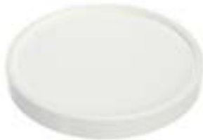
510651 SOLO LID PAPER WHITE NO VENT 8/12OZ 1/500EA