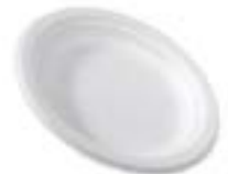
543290 CKF PLATE 6" ROYAL CHINET PAPER 4/250CA