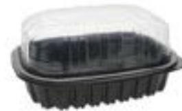
510470 PACTIV CONTAINER COMBO CHICKEN MEDIU 1/100EA