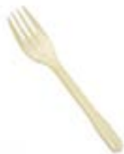
531132 POLAR FORK CREME 1/1000EA