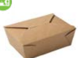
510561 HYPAX CONTAINER ECO #3 KRAFT 8.5 X 6.5 X 2.5 200/1EA