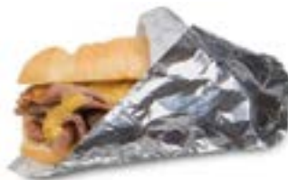
558341 DELUXE WRAP THERMO FOIL 14X14 1/1000EA