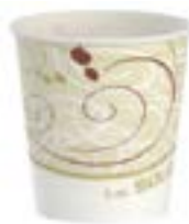
516701 DART CUP COLD WAXED SYMPHONY 5OZ 30/100CA