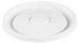
511301 SOLO 3.5 OZ LID 1/2400EA