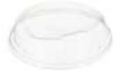
519505 STONE LID DOME SIP THRU 16/240Z 10/100PC