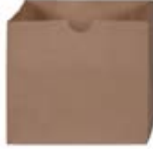
504573 DELUXE BAG SNACK- SACK 4.25X2.5X3.75" 1/1000PC