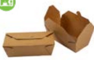
507111 HYPAX CONTAINER ECO #9 KRAFT 8.75 X 4.5 X 3 4/50EA