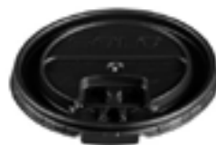
516594 SOLO LID FLIP BACK BLACK 10-24OZ 20/100EA