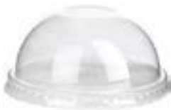
511153 POLAR LID DOME GREENSTRIPE 9-240Z 10/100EA