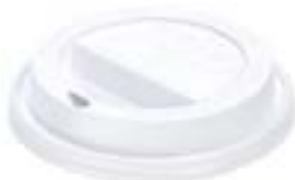
516587 SOLO LID 8OZ TRAVELLER DOME WHITE 10/100EA