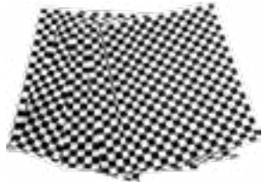
558648 DELUXE LINER BASKET BLACK CHECK 12X12 1/2000EA