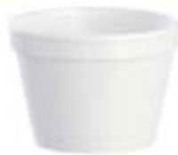
510013 DART CONTAINER FOAM 4OZ 20/50EA