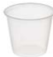
510691 STONE CUP PORTION 5.5O POLY PRO CLR 10/250EA