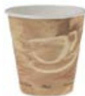
516584 SOLO CUP 8OZ HOT PAPER MISTIQUE 20/50EA