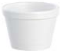
510091 DART CONTAINER FOAM SQUAT 3.5OZ 20/50EA