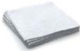
540112 CASCAD NAPKIN BEVERAGE 1/4 WHITE 1PLY 4/1000EA