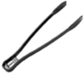
531149 POLAR TONG BLACK 9" PLASTIC 1/48EA