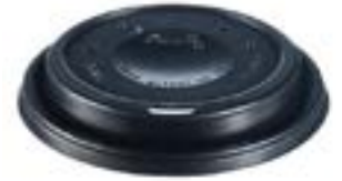
513068 DART LID DOME BLACK 12-24OZ FUSION 20/50EA