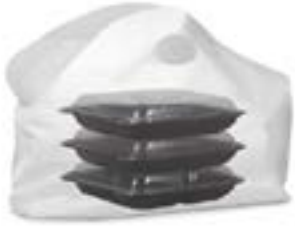
504264 DELUXE BAG TO GO WHITE 21X10X18 1/500EA