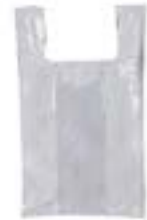
504404 ALPHA BAG T-SHIRT W/HANDLE 11X6X21 1/1000EA