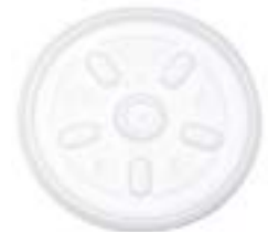
511231 DART LID TRANS VENT WHITE 10/100EA