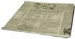
558293 DELUXE LINER BASKET 12X12 NEWSPRINT 1/2000EA