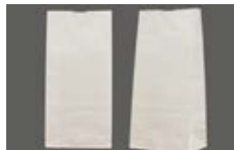
504013 ATLANT BAG 5LB GROCERY PAPER WHITE 6/500EA