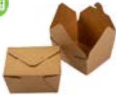
507103 HYPAX CONTAINER ECO #1 KRAFT 5 X 4 X 2.5 - 27 FLUID OZ - 9/50EA