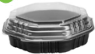
511348 DART CONT BLK HNGD MICRO 9.5X9X3" 1/100CA