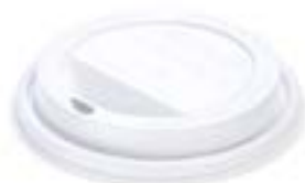
516675 SOLO LID DOME WHITE 10OZ SQUAT/20OZ 1/1000EA