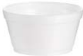
510239 DART CONTAINER FOAM EX SQUAT 12OZ 20/25EA