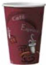
516580 SOLO CUP 16OZ HOT PAPER BISTRO 20/50EA