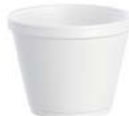
510255 DART CONTAINER FOAM 12OZ 20/25EA