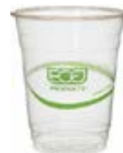
519210 POLAR CUP PLASTIC PLA 16OZ 20/50EA