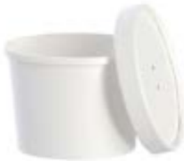
510037 SOLO CONTAINER LID COMBO PAPER 12OZ 10/25CA