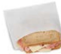
504678 DELUXE BAG SANDWICH REGULAR WAX 1/1000EA