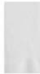
540418 LAPACO NAPKIN DINNER WHITE 1PLY 12/250EA