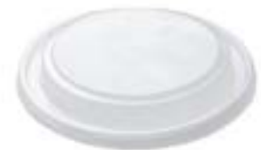
511369 HYPAX LID FOR 400Z KRAFT PAPER BOWL 6/50EA