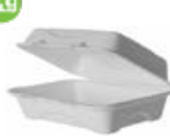
511175 POLAR CONT CLAMSHELL 9X6X3 BAGASSE 5/50EA