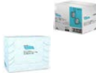
540121 CASCAD NAPKIN DINNER AIRLAID 1/8 WHT 8/50CA