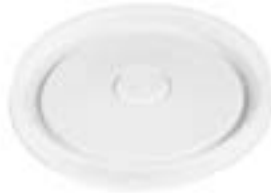
510121 SOLO LID WHITE VENT 8-10 OZ BOWL 20/100EA