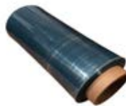
558272 WRAPIT FOOD FILM REFILL 17"X2000' 2/1RL