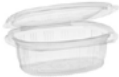
511187 PACTIV CONT 16OZ CLEAR HINGED DELI 1/200EA