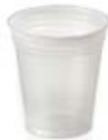
519093 POLAR CUP PLASTIC XLT TRANSLUCE 200Z 20/50EA