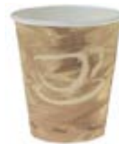
516585 SOLO CUP 12OZ HOT PAPER MISTIQUE 20/50EA