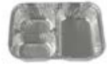
511254 PACTIV CONTAINER COMBO FOIL 3 COMP 1/200CA