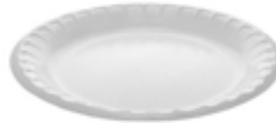
543036 PACTIV PLATE 9" FOAM LAMINATED 4/125EA