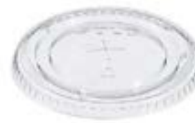
519444 SOLO NEW CLEAR PLASTIC LID 12/20OZ 10/100EA