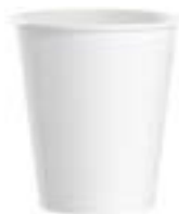
516576 SOLO CUP 12OZ PAPER HOT DRINK WHITE 20/50EA