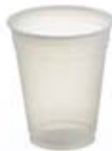
519154 POLAR CUP 9OZ XLT TRANSLUCENT 25/100CA