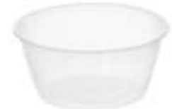
510687 STONE CUP PORTION 3.25OZ PLASTIC CLR, 10/250EA