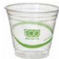
519094 POLAR CUP PLASTIC PLA 90Z 20/50CA