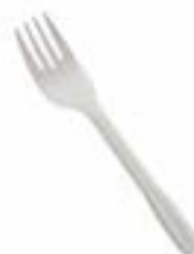
531133 POLAR FORK WHITE MED PP 1/1000EA