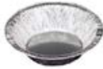
511525 PACTIV CONT FOIL POT PIE 5" 7OZ 1/750EA