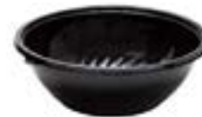
510878 POLAR BOWL SALAD BLACK 16" 3200Z PET 1/25EA