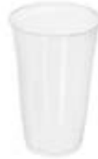
519226 STONE CUP PLASTIC PET CLEAR 240Z 12/50EA