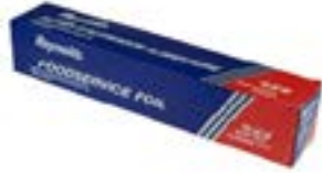
558154 PACTIV ROLL FOIL COUNTER 45CM HEAVY 1/100MR