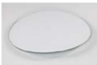
510960 PACTIV LID FOIL FOR 9" TAKE OUT CONT 1/500EA