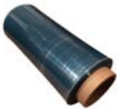
558233 WRAPIT FOOD FILM 11"X2000' REFILL 2/1RL