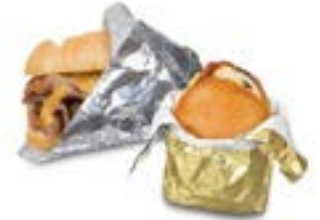
304310 DELUXE WRAP FOIL THERMO 12"X14" 1000/1PC