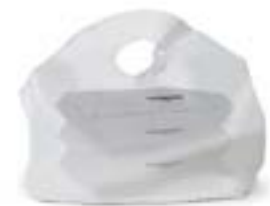
504263 DELUXE BAG TO GO WHITE 18X16X9 1/500EA