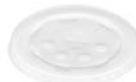
516905 SOLO LID STRAW SLOT FOR RNP16/21 16/125EA