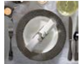
540563 LAPACO NAPKIN DINNER BELLOLINO ICE 12/50EA