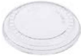
510171 POLAR LID FLAT SOLID FOR 6-15 10/100EA