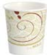
516512 SOLO CUP HOT DRINK PAPER 10OZ SYMP 20/50EA