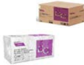
540114 CASCAD NAPKIN LUNCHEON 1/4 FOLD WHITE 12/500EA