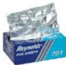
558170 PACTIV FOIL POP UP 8X10.75 6/500MR