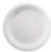
543291 CKF PLATE 8 3/4" ROYAL CHINET PAP 4/125EA