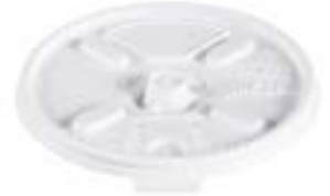
513209 DART LID LIFT'N LOCK WHITE - 10J10 10/100EA