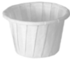
510681 SOLO CUP PORTION 3/4 OZ PAPER 20/250EA