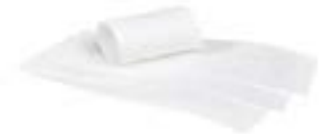
540072 LAPACO NAPKIN BAND WHITE 10/2000EA