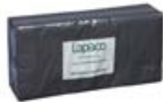
540393 LAPACO NAPKIN BEVERAGE BLACK 2PLY 5/200EA