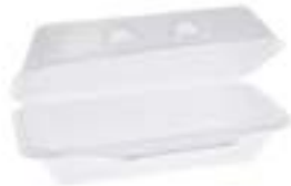
510860 PACTIV CONT FOAM HOAGIE MEDIUM 4/110CA