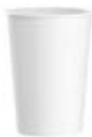
516592 SOLO CUP 20 OZ HOT PAPER WHITE 15/40EA