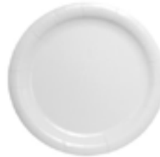
543025 SOLO HWY WEIGHT PAPER PLATE 9" 4/125EA