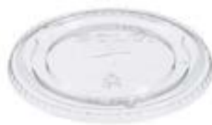
516457 SOLO LID STRAW SLOT CLEAR FOR T16TA 10/100EA