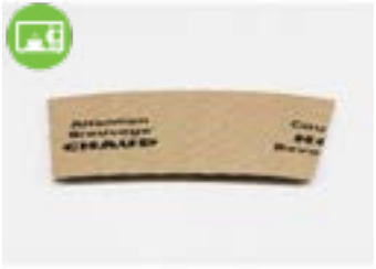
305075 PCA SLEEVE-LARGE ASSEMBLED JAVAJAC 1300/1PC