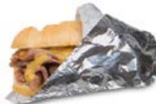
558468 DELUXE WRAP THERMO FOIL 14X14 LIGHT 1/1000EA