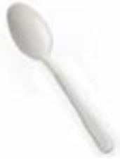
531137 POLAR TEASPOON WHITE MEDIUM PP 1/1000EA