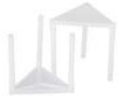
531381 STONE PIZZA SUPPORT WHITE PLASTIC 10/100CA