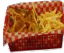
558645 DELUXE LINER BASKET RED CHECK 12X12 1/2000EA