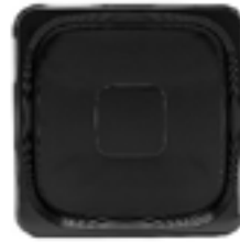
511322 POLAR TRAY SQUARE BLK 16" CONTOUR 1/25EA