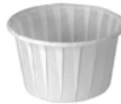
510718 SOLO CUP PORTION PAPER 4OZ 20/250CA