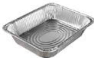
511900 PACTIV STEAMTABLE FOIL 1/2 SIZE DEEP 1/100EA