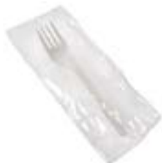
531130 POLAR FORK IND WRAPPED WHITE 1/1000EA