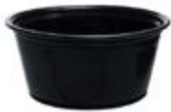
304369 SOLO CUP PORTION 3.25OZ BLK 20/125PC