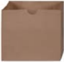
504572 DELUXE BAG SNACK SACK 3.375X1.75X3.5" 1/1000PC