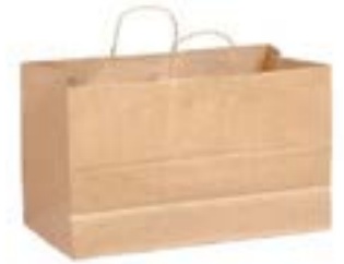
504405 DELUXE BAG PAPER HANDLE KRAFT 13X7X13 1/250EA