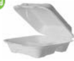
511112 POLAR CONT 3 COMP 8X8X3 BAGASSE 4/50EA