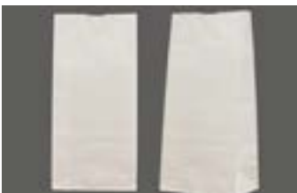
504011 ATLANT BAG 3LB GROCERY PAPER WHITE 10/500EA