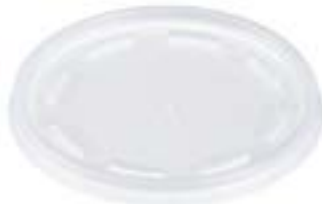
510092 DART LID WHITE VENT 6JL 10/100EA