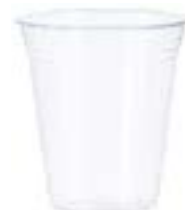
516634 SOLO 16OZ COLD ULTRA CUP CLEAR 20/50EA