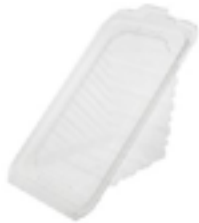
511184 PACTIV CONT SANDWICH WEDGE HNG LG 1/250CA