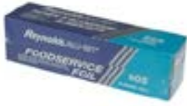
558143 PACTIV ROLL FOIL COUNTER 30CM REG 1/200MR