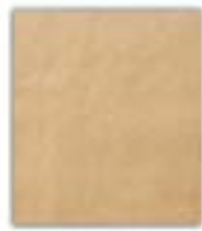
558357 DELUXE WRAP ECOCRAFT NAT GP 12X12 5/1000PT