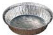
511102 PACTIV CONT FOIL TAKE OUT 7" ROUND 1/200EA