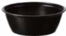
510684 STONE CUP PORTION 2OZ BLACK 10/250EA