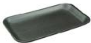
510840 PACTIV TRAY FOAM BLACK 17S 1/1000EA