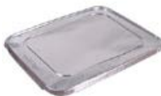
511256 PACTIV LID FOIL 1/2 STEAMTABLE 1/100EA