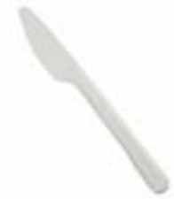
531136 POLAR KNIFE WHITE MED PP 1/1000EA