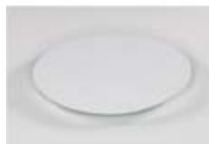
510956 PACTIV LID FOIL FOR 7" TAKE OUT CONT 1/500EA