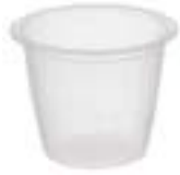
511000 STONE CUP PORTION 10Z PLASTIC CLR 10/250EA