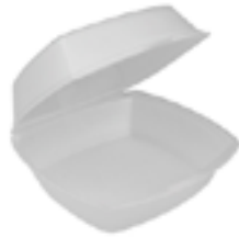
510308 PACTIV CONT SANDWICH FOAM 6X6X3 4/125EA