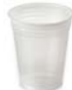
519149 POLAR CUP 14OZ XLT TRANSLUCENT 20/50EA