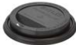
516588 SOLO LID DOME BLACK 10OZ SQUAT/24OZ 10/100EA