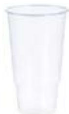
519282 CONEX CUP 32OZ PLASTIC CLEAR PRO 20/25EA