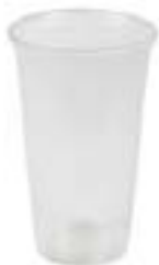
519112 POLAR CUP 7OZ PLASTIC CLARUS 50/50EA