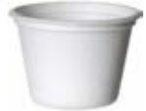
511336 POLAR CUP PORTION SUGARCANE 4OZ 36/50EA