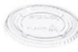
511229 DART LID PORTION CLEAR 1.5-2.5 OZ 20/125EA