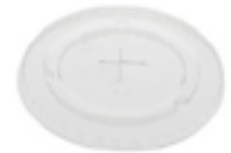
519037 PACTIV LID CLR 14-16OZ STRAW SLOT 12/85EA