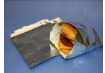
504750 DELUXE BAG HAMBURGER FOIL 1/1000EA