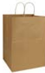
504405 DELUXE BAG PAPER HANDLE KRAFT 13X7X13 1/250EA