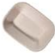
510700 CKF TRAY FOOD SAVADAY #200 1/500EA