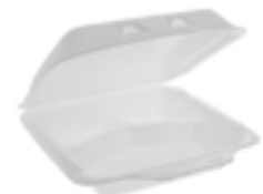
510853 PACTIV CONT FOAM SM 3 COMP 7.5X8X2 1/150EA