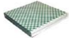
558647 DELUXE LINER BASKET GREEN CHECK 12X12 1/2000EA