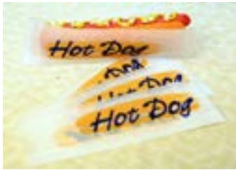
504686 DELUXE HOLDER HOT DOG W/GUSSET 1/1000EA