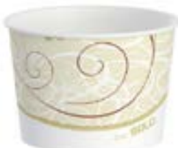
511402 SOLO CONT PAPER HOT/COLD 100Z 20/50EA