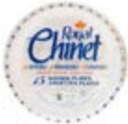
543293 CKF PLATE 10 3/8 XSTG ROYAL CHINET 24/15EA