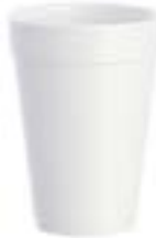
513452 DART CUP 200Z PLAIN FOAM 20/25EA