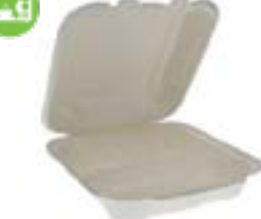
305254 PCA CONT COMPOST 8X8 3 COMP MICRO 150/1PC