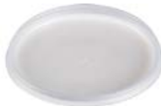
510252 DART LID TRANSLU- CENT VENT 32JL 5/100EA