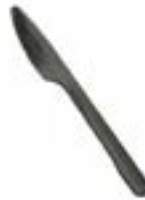
531143 POLAR KNIFE BLACK MED POLYSYRENE 1/1000EA