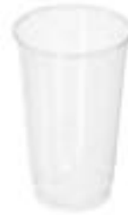
519502 STONE CUP 120Z CLEAR TAKE & GO 20/50EA