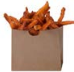
504572 DELUXE BAG SNACK SACK 3.375X1.75X3.5" 1/1000PC