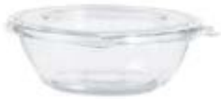
511498 DART BOWL TAMPER EVIDENT 8OZ 1/240PC