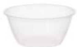
510688 STONE CUP PORTION 4OZ PLASTIC CLR 10/250EA