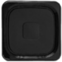
511320 POLAR TRAY SQUARE BLK 14" CONTOUR 1/25EA