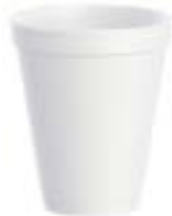
513406 DART CUP 12OZ PLAIN FOAM 40/25EA