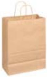
504543 DELUXE BAG W/ HANDLE NAT MISSY 10X5X13 1/250PC