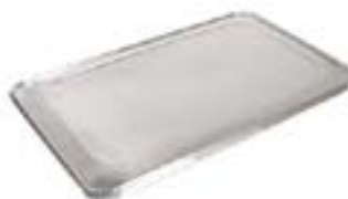
511385 PACTIV LID FOIL FULLSIZE STEAM 1/80EA