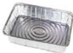
510476 PACTIV STEAMTABLE FOIL FULL SIZE MED 1/50EA