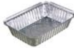
511703 PACTIV CONT FOIL 8X6 X1 13/16 2.25LB 1/400CA