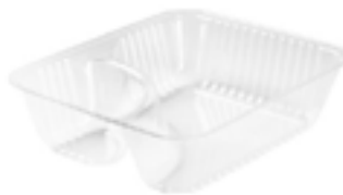
510680 SOLOTRAY NACHO SMALL 5X6 1/500EA