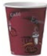
516577 SOLO CUP 12OZ HOT PAPER BISTRO 20/50EA