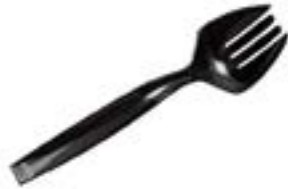
531150 POLAR FORK CATER SERVING BLACK 1/144EA