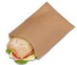
504691 DELUXE BAG SANDWICH NATURAL LARGE 1/1000EA