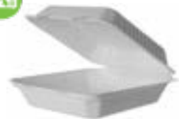
511071 POLAR CONT MEAL HINGED 9" BAGASSE 4/50EA