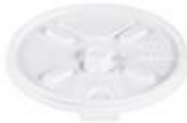
513448 DART LID LIFT 'N LOCK 10,12,14J12 1/1000EA