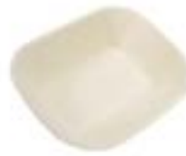
510701 CKF TRAY FOOD SAVADAY #300 1/500EA