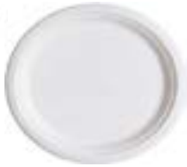
543382 POLAR PLATE BAGASSE 10 3/8" 4/125EA