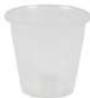
519146 POLAR CUP 12OZ CLARUS POLY 20/50EA