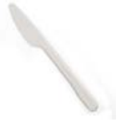
531159 POLAR KNIFE ECOPRO DEGRADABLE 1/1000EA