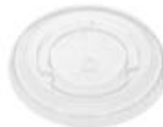
510686 STONE LID PORTION FOR 1.5 - 2.5 OZ 25/100EA