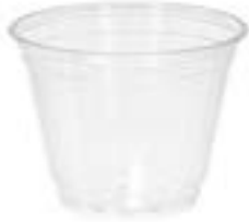
519500 STONE CUP 90Z CLEAR TAKE & GO 20/50EA