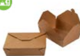
507156 HYPAX CONTAINER ECO #4 KRAFT 8 1/2 X 6 1/2 X 3 1/2 DEEP - 4/50EA