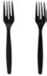
531007 511 FORK BLACK HEAVY DUTY 1/1000EA