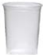
510598 POLAR CONTAINER DELI CLEAR PLAS 32OZ 1/500EA