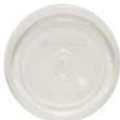
510469 SOLO LID TRANSLU- CENT VENT 8/12 OZ 1/500EA