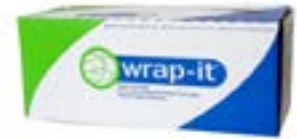
558218 WRAPIT FOOD FILM & CUTTER 11" 'X2500' 1/1RL