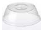
519163 POLAR LID DOME STRAW SLOT 10/100EA