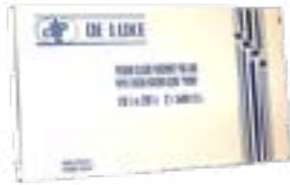
558514 DELUXE LINER SILICONE 18.5X26.5 1/1000EA