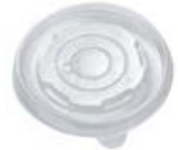
511572 HYPAX LID FOR KRAFT PAPER BOWL 8 OZ 20/50EA