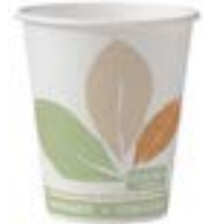
516490 DART CUP HOT DRINK 12OZ BARE PLA 20/50EA