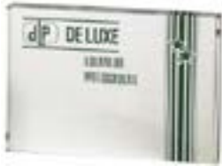
558512 DELUXE LINER QUILON 16.5X24.5 1/1000EA