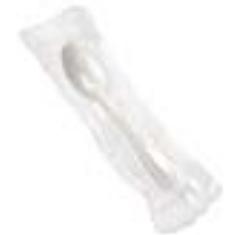
531128 POLAR TEASPOON INDIVIDUAL WRAPPED 1/1000EA