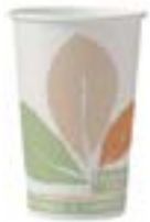
516493 DART CUP HOT DRINK 20OZ BARE PLA 40/15EA