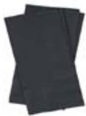
540391 LAPACO NAPKIN DINNER BLACK 2PLY 5/200EA