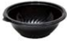
511309 POLAR BOWL SALAD BLACK 9" 48OZ PET 1/50EA