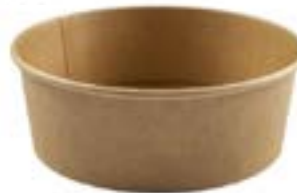
511368 HYPAX BOWL KRAFT PAPER 400Z 6/50EA