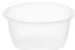
510685 STONE CUP PORTION 2OZ POLY PRO CLR 10/250EA