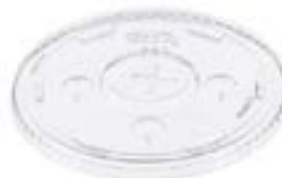
519283 CONEX LID FOR 32OZ CLEARPRO 20/50EA