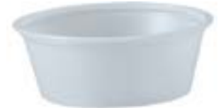
519695 SOLO CUP PORTION PLASTIC PS 1.5 OZ 10/250EA