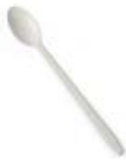
531108 POLAR SPOON SODA WHITE 8" MED POLY 1/1000EA