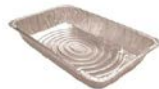
511325 PACTIV FULL SIZE STEAM PAN DEEP 12X20 1/40EA