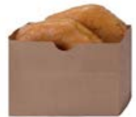
504573 DELUXE BAG SNACK SACK 4.25X2.5X3.75" 1/1000PC