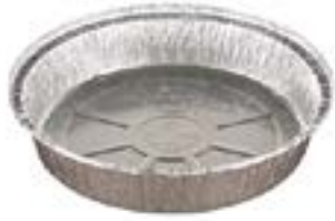
511281 PACTIV CONT FOIL TAKE OUT 9" ROUND 1/300EA