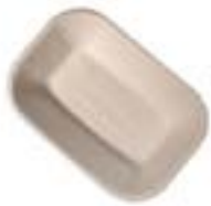
510699 CKF TRAY FOOD SAVADAY #100 1/1000EA