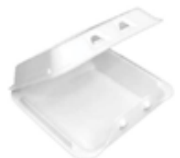
510856 PACTIV CONT FOAM LG 1 COMP 9X9.5X3.2 1/150EA