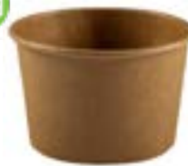
511571 HYPAX BOWL KRAFT PAPER 8 OZ 20/50EA