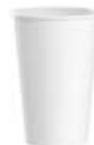
516590 SOLO CUP 16OZ PAPER HOT DRINK WHITE 20/50EA