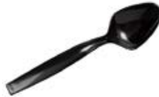
531151 POLAR SPOON CATER SERVING BLACK 1/144EA