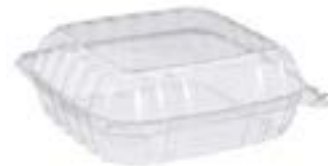
511350 DART CONT CLAMSHELL CLR PLAS 8.3" 1/250EA