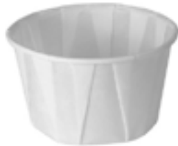
510705 SOLO CUP PORTION 2 OZ PAPER 20/250EA