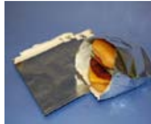
504749 DELUXE BAG HAMBURGER LARGE FOIL 1/1000EA