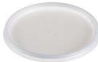
510244 DART LID TRANSLU- CENT VENT 20JL 10/100CA