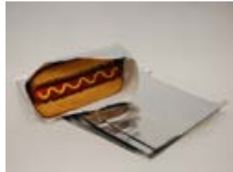
504753 DELUXE BAG HOT DOG FOIL 1/1000EA