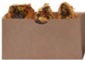
504574 DELUXE BAG SNACK SACK 4X1.75X3.13" 1/1000PC