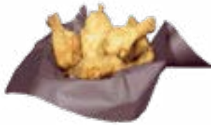
558650 DELUXE LINER BASKET CHOCOLATE 12X12 1/2000EA