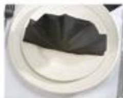
540080 LAPACO NAPKIN FLAT 16X16 BLK NU LINEN 4/125EA