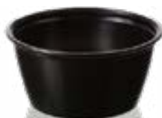
510690 STONE CUP PORTION 3.25OZ BLACK 10/250EA