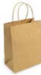
504463 DELUXE BAG KRFT PAPER HANDLE 8X4.5X10 1/250EA