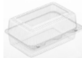
510436 PARPAK BOX LUNCH PLASTIC EXTRA DEEP 1/250EA