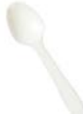
531109 POLAR SPOON TASTER BELLE WHITE 1/3000EA