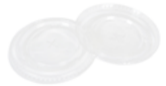
519227 STONE LID FLAT CLR 16 & 240Z 10/100EA