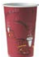
516591 SOLO CUP 20 OZ HOT DRINK BISTRO 20/40EA