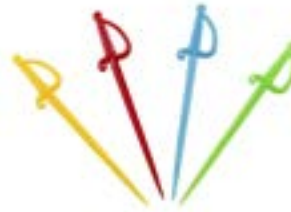
531353 STONE SWORD 3" ASSORTED 1/2000EA