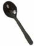
531146 POLAR SPOON SOUP BLK MED POLYSTRENE 1/1000EA