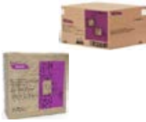
540117 CASCAD NAPKIN DINNER 1/8 1PLY MOKA 12/250EA