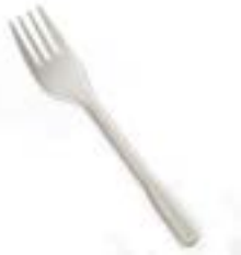
531160 POLAR FORK ECOPRO DEGRADABLE 1/1000EA