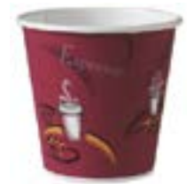
516579 SOLO CUP 100Z SQUAT PAPER BISTRO 20/50EA