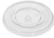
511002 STONE LID FOR 10Z PORTION CUP 25/100EA