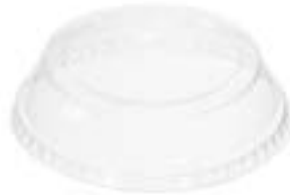
519501 STONE LID DOME CLEAR TAKE & GO 20/50EA