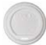
516641 POLAR LID ECO WHITE HD PLA 10-200Z 16/50EA