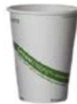
516643 POLAR CUP HOT DRINK PLA 120Z 20/50EA