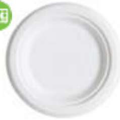
543021 POLAR PLATE COMPOST 6" GREENSTRIPE 20/50EA