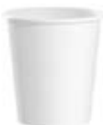
516574 SOLO CUP 100Z SQ HOT PAPER WHITE 20/50EA