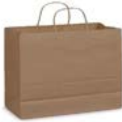
504543 DELUXE BAG W/ HANDLE NAT MISSY 10X5X13 1/250PC