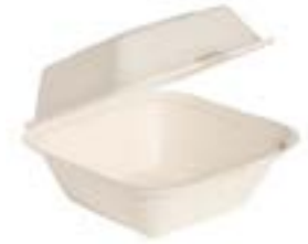
511079 SOLO 6" HINGED SUGARCANE CONTAINER 1/400CT