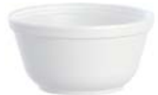
510247 DART 10 OZ BOWL 20/50EA