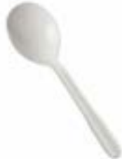
531139 POLAR SPOON SOUP WHITE MED PP 1/1000EA