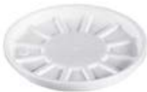
510250 DART LID FOAM VENT 20RL 10/50EA