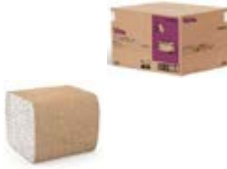
540119 CASCAD NAPKIN FULL FOLD WHITE 18/334EA