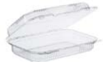
511091 DART CONT CLR HNG PET 36OZ 1/250EA