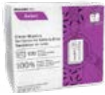
304370 CASCAD NAPKIN DINNER 2PLY 8FOLD WHT 1 30/100PC