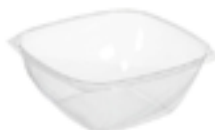
511296 POLAR BOWL SQUARE 48 OZ CLEAR 1/300EA