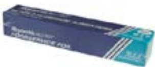
558156 PACTIV ROLL FOIL COUNTER 45CM REG 1/100MR