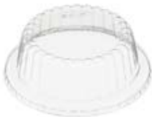
511173 SOLO FLAT TOP DOME LID FOR VS516 1/500EA