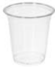
305301 STONE CUP PLSTC COLD 200Z CLEAR PET 1000/1PC