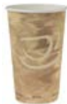
516586 SOLO CUP 20OZ HOT PAPER MISTIQUE 15/40EA