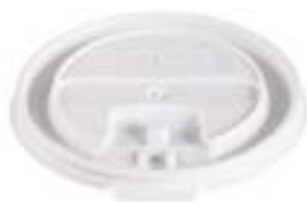
516674 SOLO LID TEAR 10OZ SQ- 24OZ WHITE 1/2000EA