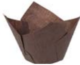
558295 DELUXE BAKING CUP TULIP BROWN 10/200EA