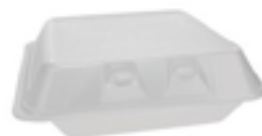
510857 PACTIV CONT FOAM LG 3 COMP 9X9.5X3 1/150EA